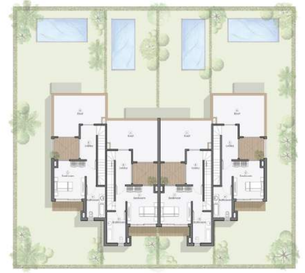
TOWN HOUSE SECOND FLOOR