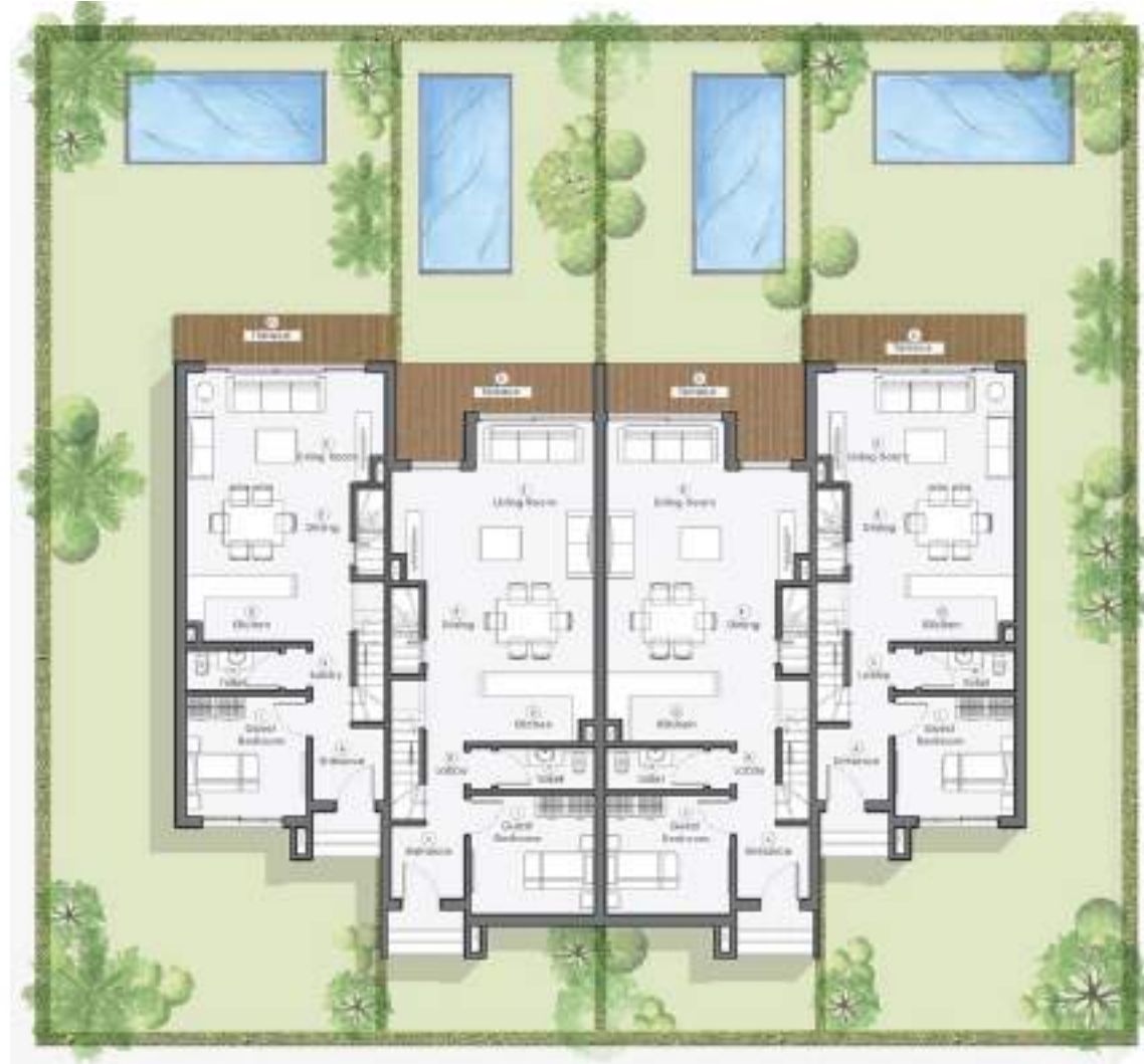
TOWN HOUSE GROUND FLOOR