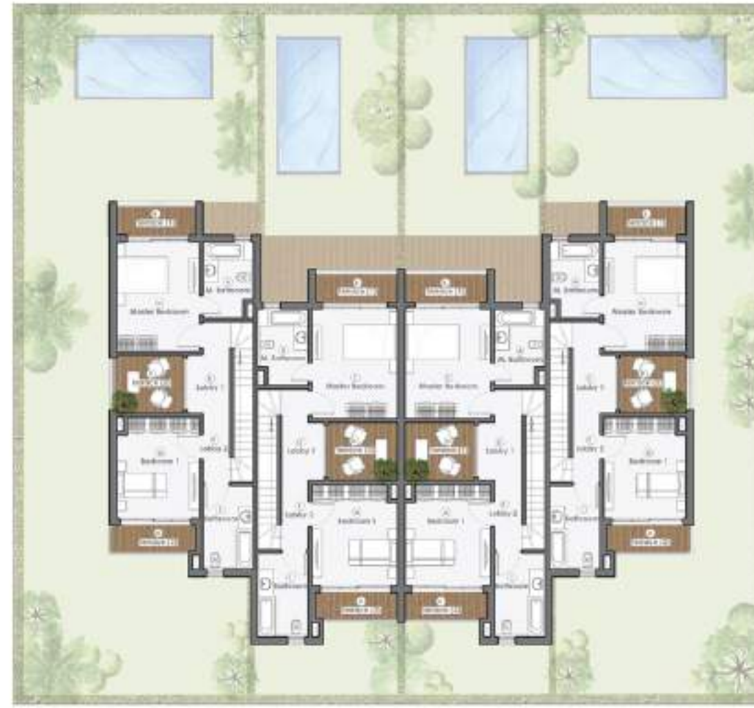
TOWN HOUSE FIRST FLOOR